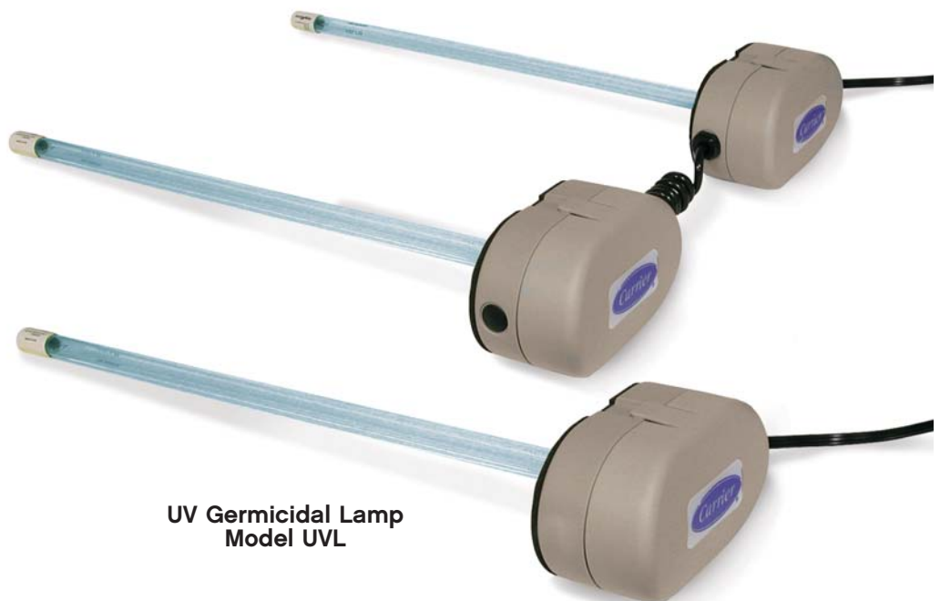
UV Germicidal Lamp Model UVL