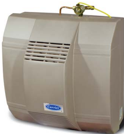
Model LFP Humidifier