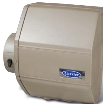
Model LBP Humidifier