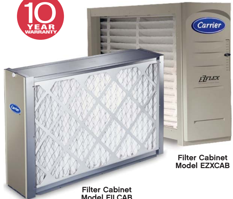
Filter Cabinet Model FILCAB