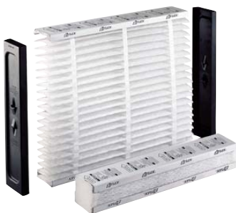
Carrier Filters: Model EXP EZ Flex, Model FILCC