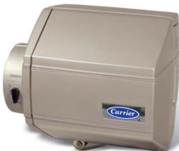
Model SBP Humidifier